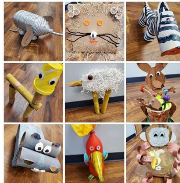
Children's recycled animal projects