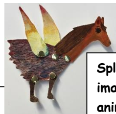
Split pin imaginary animals