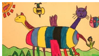
Animal mix up drawing

Add colour/ detail - using recycled objects/ materials- buttons/ bottle tops/