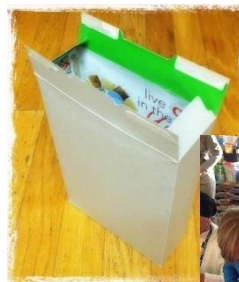
Modelling with recycled materials