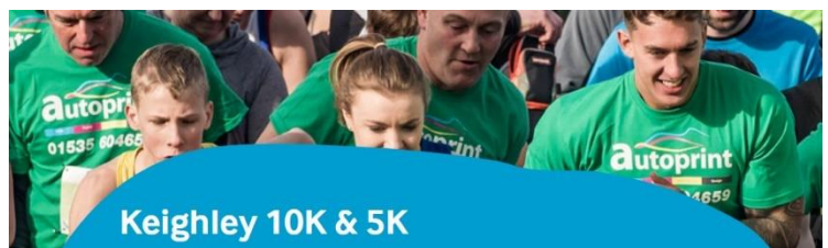
Keighley 10K & 5K