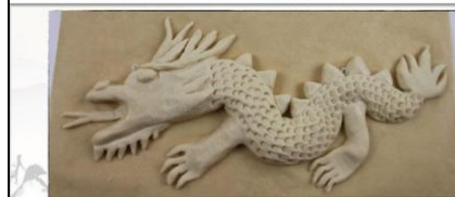
Clay/ salt dough Dragons