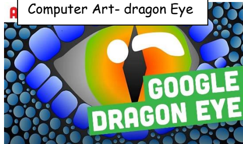
Computer Art- dragon Eye