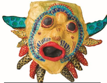
Painted Modroc Mask KS2