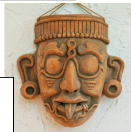
Mayan god of the sun