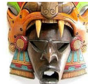
Mayan Battle masks