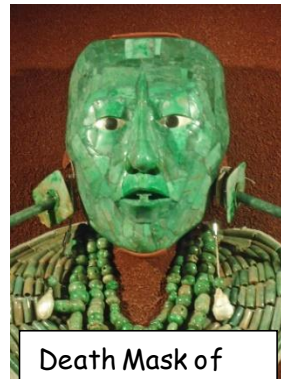
Death Mask of Pakal the Great