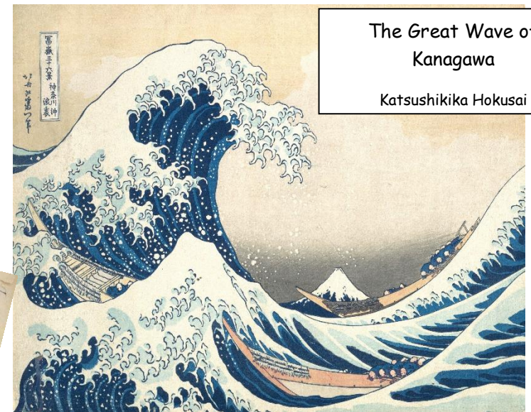
The Great Wave of Kanagawa